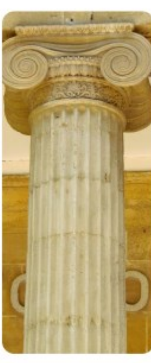
thinner than Doric columns and stood on a base with scrolls decorating the capital at the top.