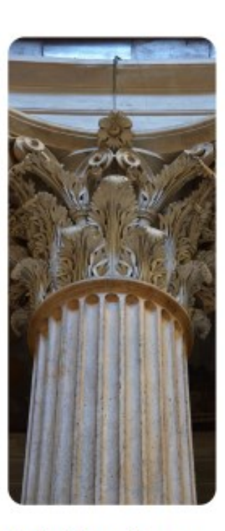
Corinthian columns were the most decorative, with scrolls and leaves of the acanthus plant carved around the capital at the top.