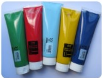
coloured printing inks