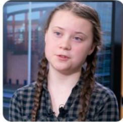
Greta Thunberg campaigns to stop climate change.