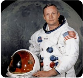
Neil Armstrong was the first person to walk on the Moon.