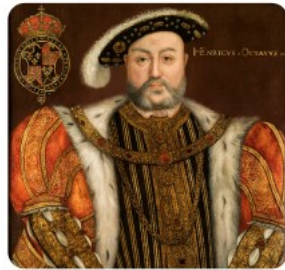
Henry VIII was the king who formed the Church of England.