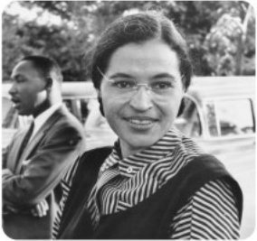
Rosa Parks wanted black people to have the same rights as white people.