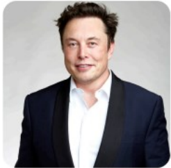
Elon Musk is trying to make a rocket to go to Mars.