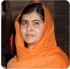
Malala Yousafzai campaigns for girls to have the right to go to school.