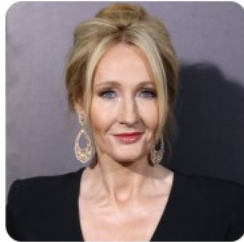
JK Rowling wrote the Harry Potter books.

Discover - To see or find something before anyone else.