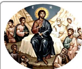
The Eight Beatitudes