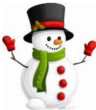
El muñeco de nieve