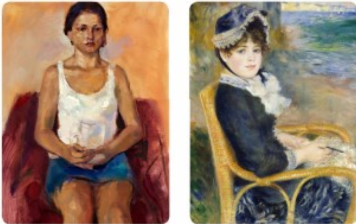
The textures of these two portraits are similar but the colours are different.

Portraits can be compared. The subject, colour, form, texture or composition of portraits can be similar or different.