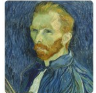
Self-portrait, Vincent van Gogh, 1889

A self-portrait is a portrait that an artist produces of themselves.