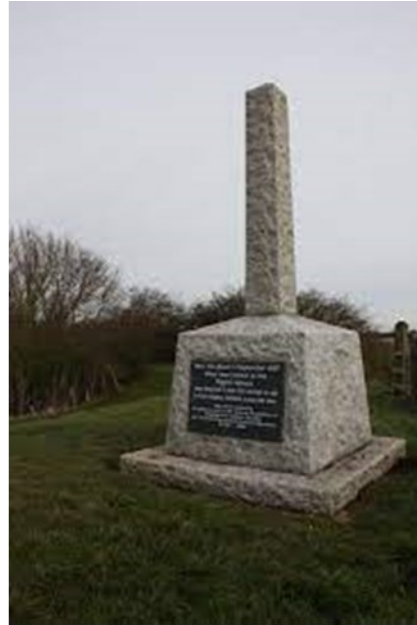
Pilgrim Fathers' Memorial