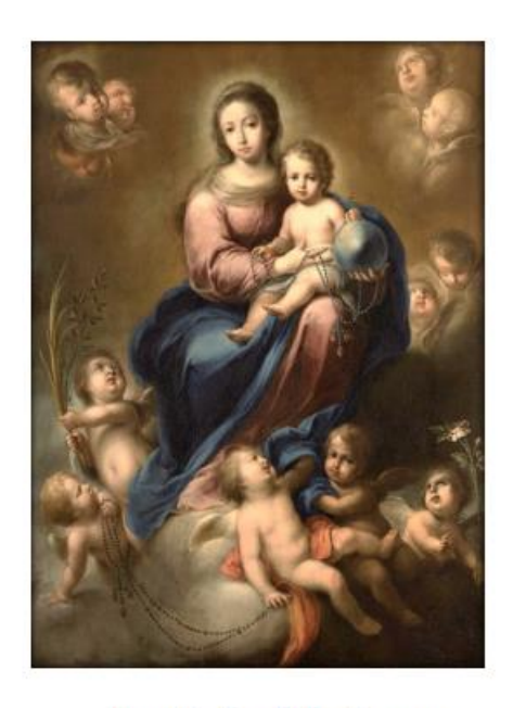
Our Lady of the Rosary In the end my Immaculate Heart will triumph! Fiat!