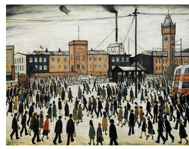
Going to Work by LS Lowry, 1959