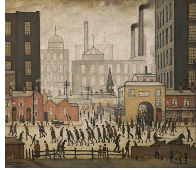
Coming from the Mill by LS Lowry, 1930

LS Lowry was an artist who lived from 1887 to 1976. He was famous for his simplistic, elongated figure drawings and paintings of the industrial urban landscapes of Manchester in the north of England.