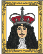
King Charles II