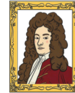
Sir Christopher Wren